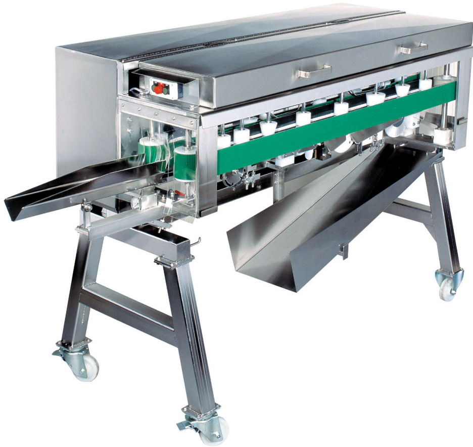
TRIO LS 105 GUTTING MACHINE